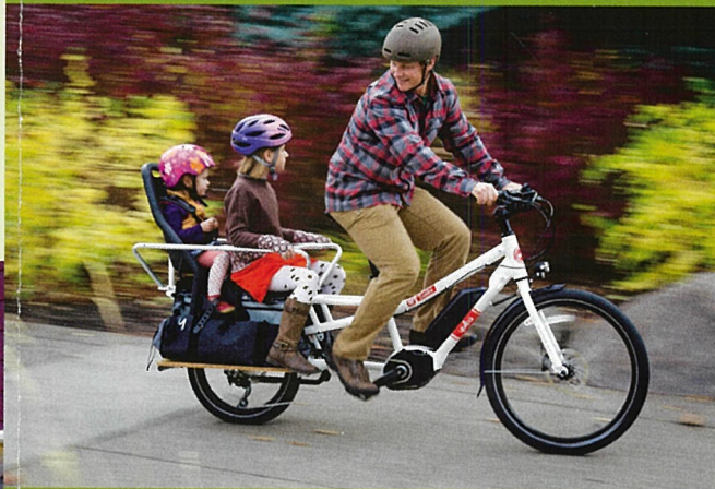
The ride into our electric future will be led by bikes. (Car and Driver, 2019)