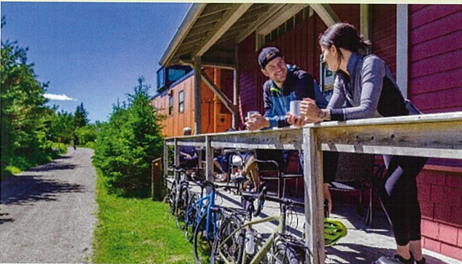
Cyclists stop along Rum Runner Trail in Nova Scotia

That same year, the Myra Canyon section of BC's Kettle Valley trail welcomed 54,000 visitors. The magical natural beauty of the Vancouver Island Corridor will surely become a major tourist draw.