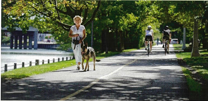
La Route Verte meets the needs of many users

Cycling tourism on rail-trails generates significant revenue. On Quebec's La Route Verte rail-trail system bike tourists spent $200/day in 2014.